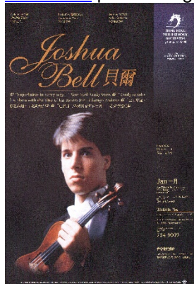
Joshua Bell's debut with the HK Phil (1994)