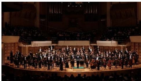
Hong Kong Philharmonic Orchestra