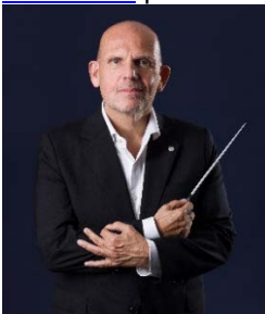
Jaap van Zweden