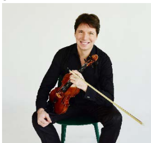
Joshua Bell