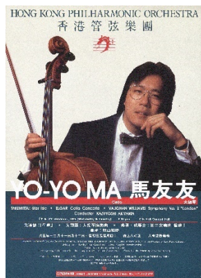
Yo-Yo Ma was due to appear with the HK Phil in December 1985. Nevertheless, he was unable to come to Hong Kong owing to illness. His debut with the HK Phil was postponed to 1986.