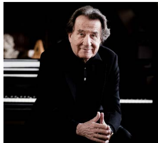
Rudolf Buchbinder