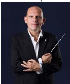
Jaap van Zweden